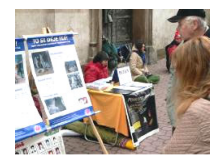
Passers-by learning about the cruel tortures used against Falun Gong practitioners in China.

Many Czech people still remember the era of communist rule over Czechoslovakia. They remember the persecution of those who hold different beliefs or opinions.